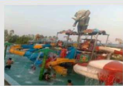
Jungle Safari Water Park