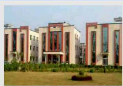
IMS Engg. College